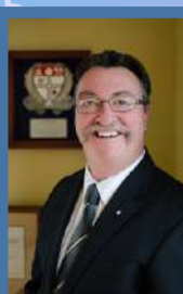
Syd Gravel Canada