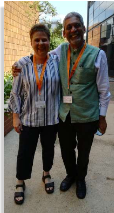
GMHPN Founder/CEO with Prof Vikram Patel at the Global Mental Health Summit 2018 where the GMHPN was launched

Empathy, a skill which health care providers need to practice to master, comes naturally. It is for this reason that people with the lived experience of mental health problems are such a valuable resource to support others in their community who are struggling with similar problems in recovery. There are many mechanisms which explain how such peer intervention works: helping reduce social isolation by doing things together; managing distressing symptoms by sharing tips about what worked for them; addressing barriers in the health care system by helping the person navigate them; realizing the aspiration to get a job by introducing the person to employment opportunities; and much more! Moreover, this is not a one-way process in which one person helps the other, as happens in the typical health care encounter; the miracle of peer support is that both people are benefited, as the act of caring for someone else is a major driver of one's own well-being. Peers can also play a valuable role in training health care providers to be sensitive and attentive to the needs of people struggling with mental health problems. This is why a fairer deal for people with mental health problems must include a defined role for people with the lived experience in the health and social welfare system.”